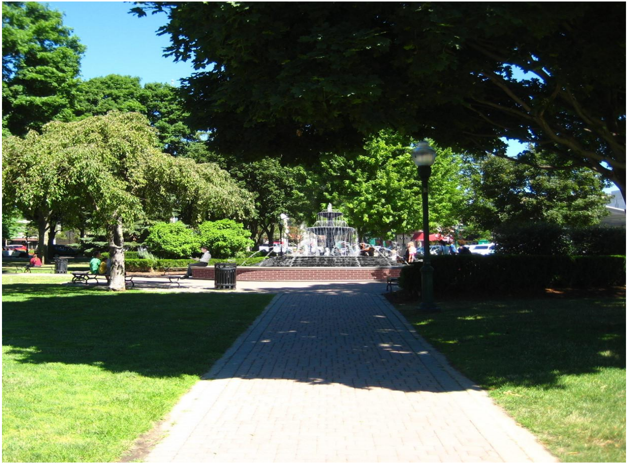
A look at what the proposed traditional fountain will look like in Kellogg Park.

The City of Plymouth Downtown Development Authority, in conjunction with the City of Plymouth, is embarking on a major project to make upgrades to Kellogg Park and update the water fountain.