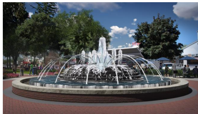
Proposed contemporary option